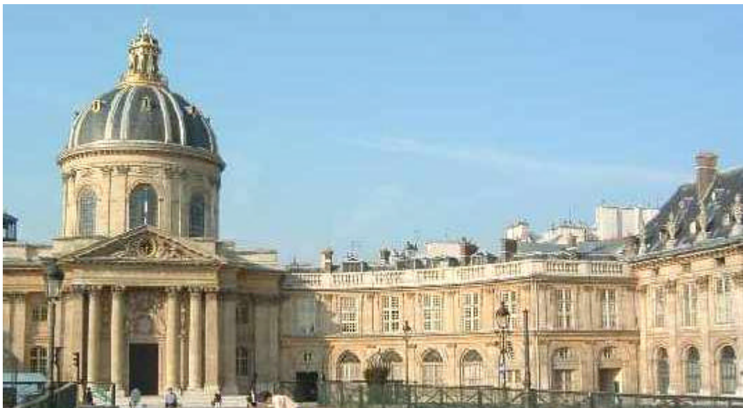
The famous Palace and cupola of the 'Institut de France', Paris, 23 Quai de Conti. The Institute nurtured the so-called GID international inter-academic initiative under the high moral authority of which the scientific background of the 'Union for the Mediterranean' political initiative will be built upon. A key decision meeting about the organization and start of the related works was held here on January 24, 2008.